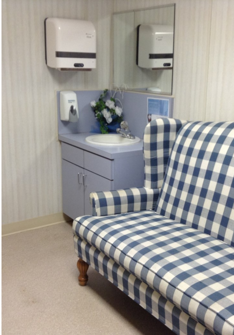
LACCA has a new lactation room available for nursing mothers

World Breastfeeding Week is August 1–7th. Activate Allen County will bring awareness to this theme the week of August 5th through our Monday Education Initiative. Tune in to WLIO at 6:25